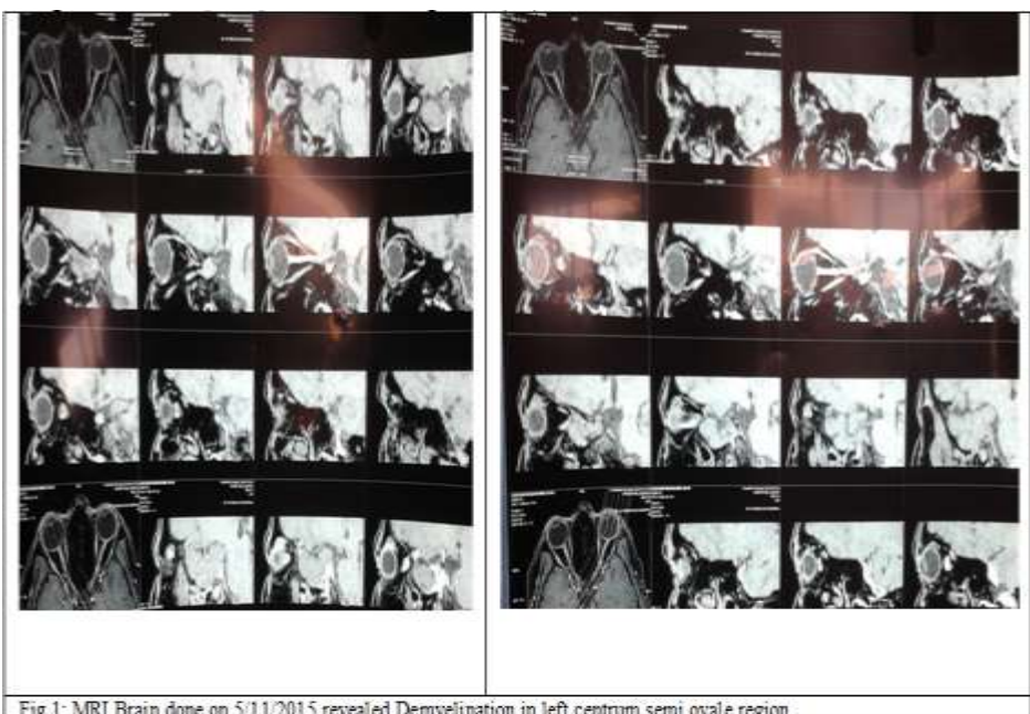
Fig. 1: MRI Brain done on 5/11/2015 revealed Demyelination in left centrum semi ovale region.

Oligoclonal Band(OCB) = 1.5, Immunoglobin (IG) Index= 20.8